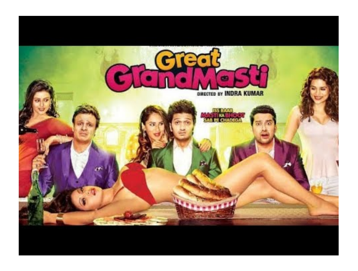
Grand Masti 720p Hindi Movie